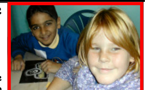
• Two Y6 children creating part of the 'Big Picture' in their community held at Audley Junior School