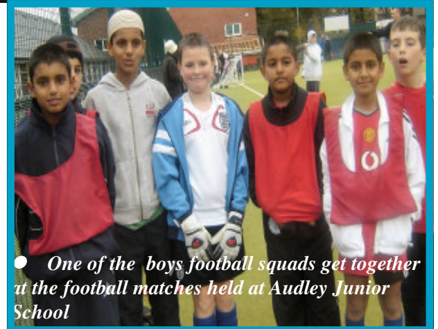
● One of the boys football squads get together at the football matches held at Audley Junior School

They went into the main hall sat together in schools and then got all shuffled up into teams. All the