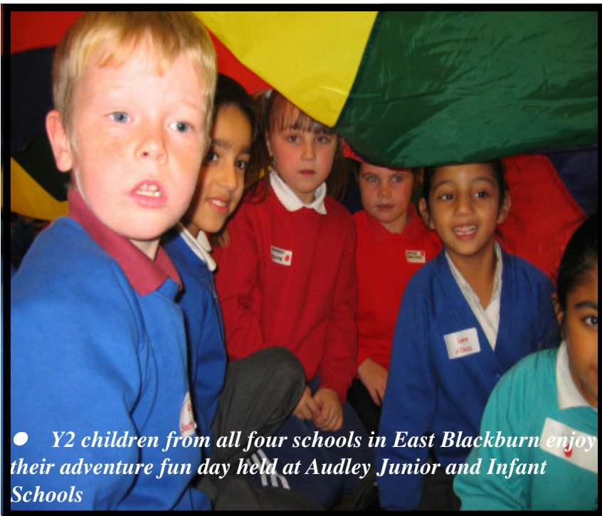
● Y2 children from all four schools in East Blackburn enjoy their adventure fun day held at Audley Junior and Infant Schools