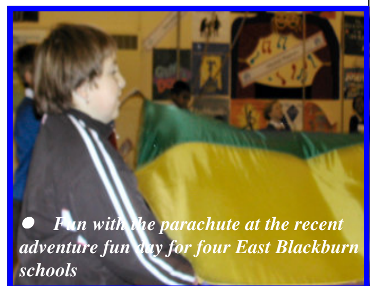
● Fun with the parachute at the recent adventure fun day for four East Blackburn schools