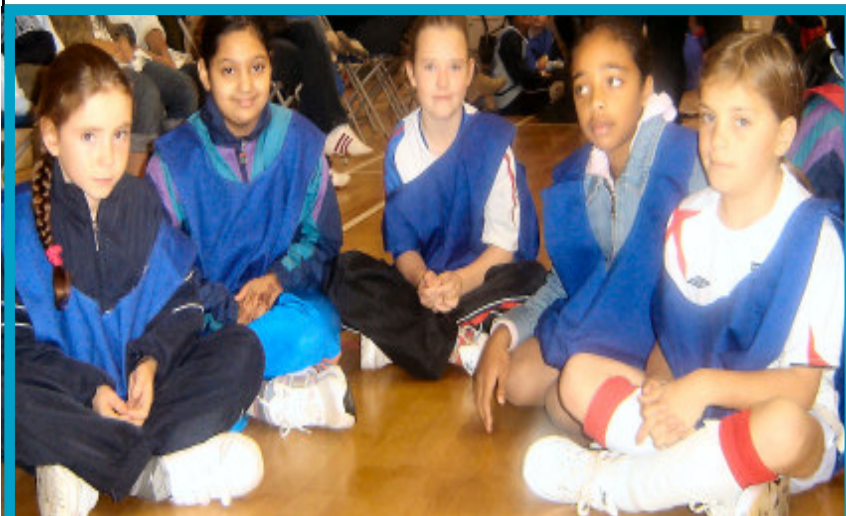
● Sporting ladies, footballers from the four schools take a rest before their East Blackburn Kids United football tournament

On the Friday of the Autumn half term children from Audley Junior School, St. Mary's and St. Joseph's R.C. Primary School, St. Thomas' C of E Junior school and Shadsworth Junior school went to Audley Junior School to do a football activity so that they would get to know each other for when they go to Secondary school.