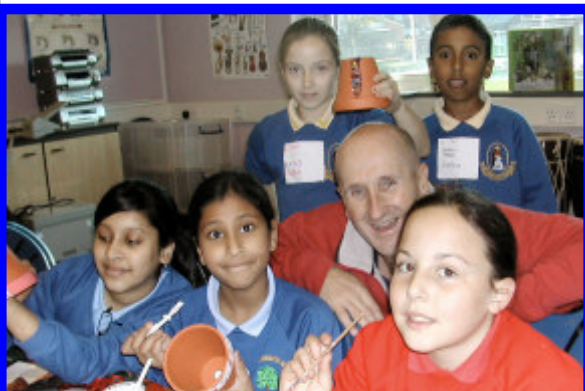
• 'Potty' children plant the seeds of friendship for the future in their planting activity recently