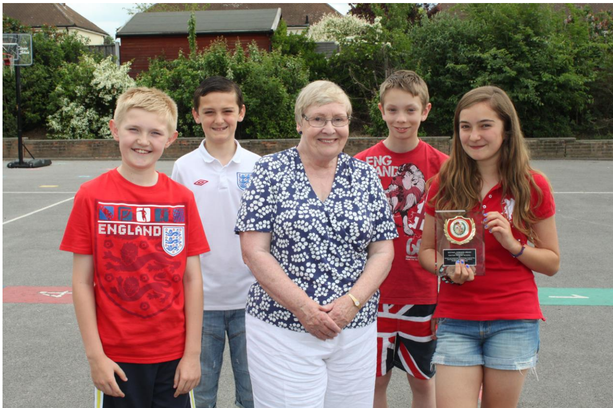
House-team Leaders at Hacton Primary School with their Michael Edwards Award